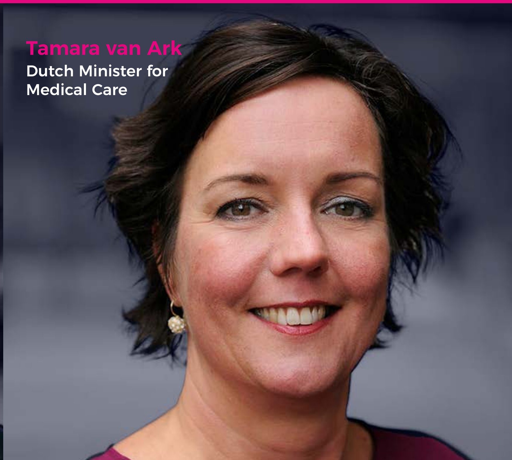
Tamara van Ark Dutch Minister for Medical Care

“From a medical point of view, there is no evidence of a medical effect of wearing face masks, so we decided not to impose a national obligation,”